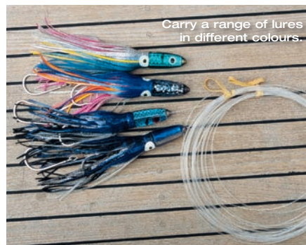
Carry a range of lures in different colours.

pointing out for the newcomers. When selecting lures for tuna, the scooped-faced jet-heads and bullet-heads shown hereabouts are among the best, and medium cut-faced heads are also good. Brighter colours with yellow and green, and silver, blue and red combinations are popular. Chrome jet-heads with multi-coloured tinsel in the skirts also work very well. One important thing when rigging tuna lures: never go too heavy with the trace material; yellowfin have a keen eye, plus heavy trace or leader can prevent some lures from working properly.