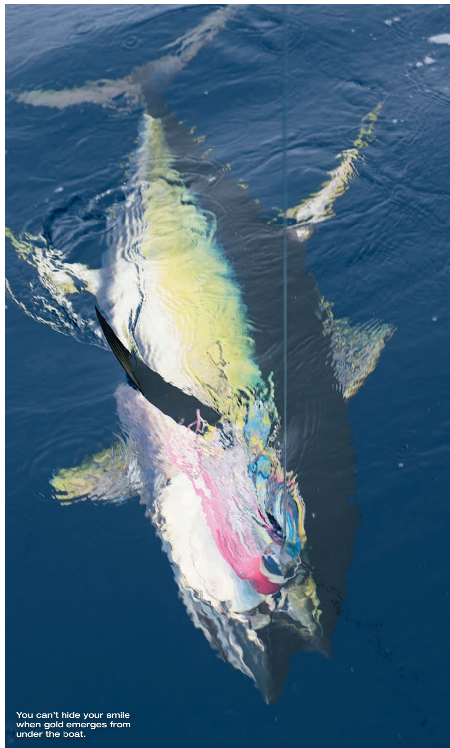
You can't hide your smile when gold emerges from under the boat.