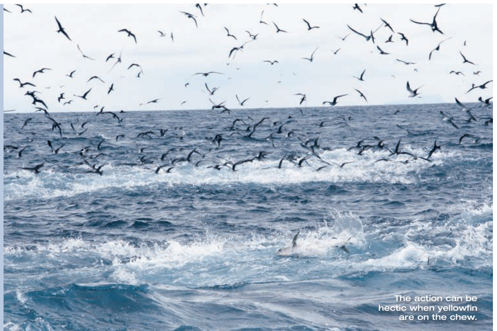
The action can be hectic when yellowfin are on the chew.

Ph: (02) 9280 1405 Email: info@oceanblue.com.vu Website: www.oceanblue.com.vu