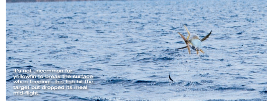
It's not uncommon for yellowfin to break the surface when feeding—this fish hit the target but dropped its meal mid-flight.

Lures are the key for consistent yellowfin success and there are a few techniques worth