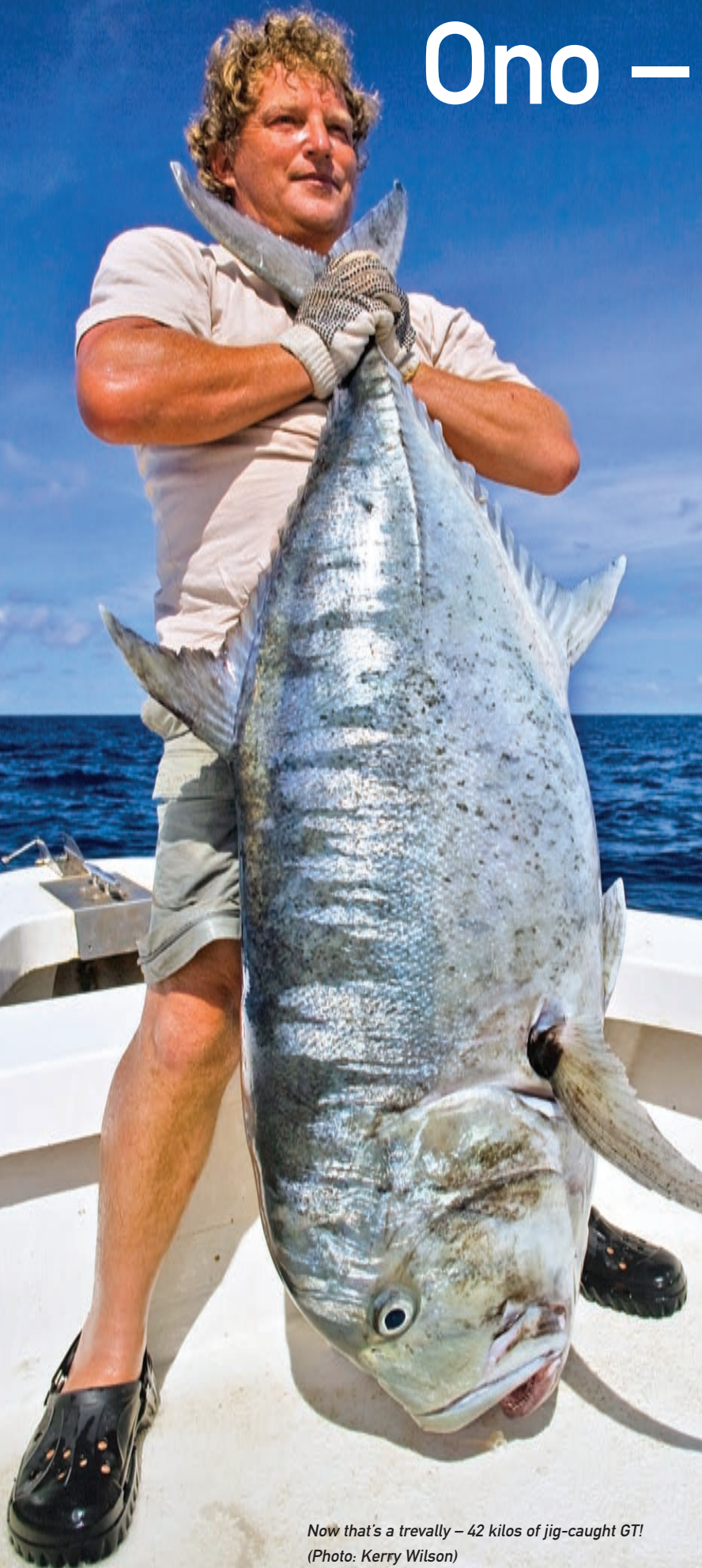
Now that's a trevally – 42 kilos of jig-caught GT!

Prior to each major trip, with the possible scenarios ahead seemingly endless and unrestrained by reality, one can't help wondering, 'Will this be the one?'