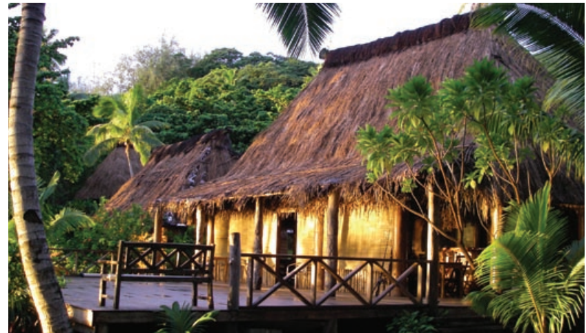
The lovely Ono Island Resort