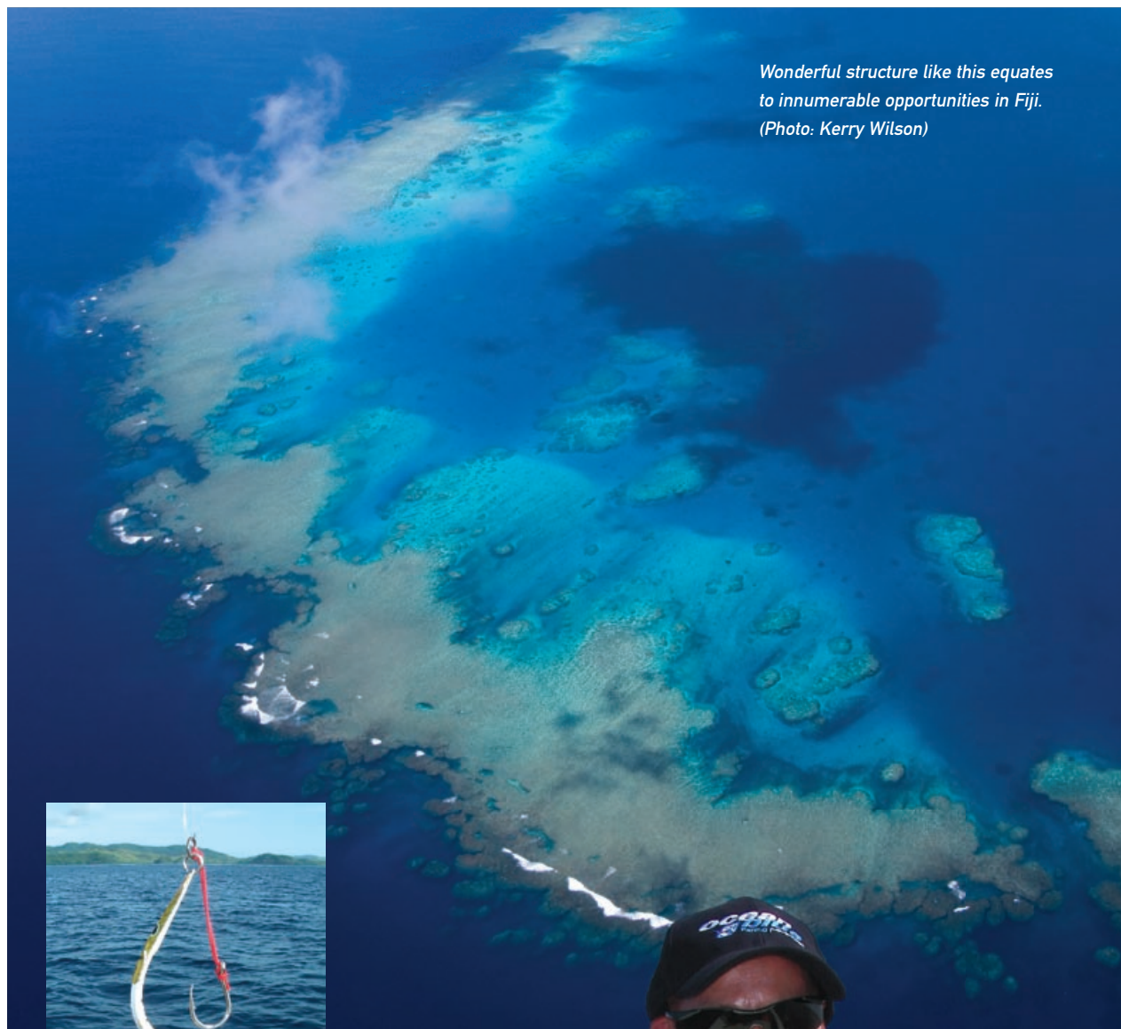
Wonderful structure like this equates to innumerable opportunities in Fiji.

Sure enough, I'd only completed a couple of bloop when a massive shape exploded onto the lure, the immensity and savagery of the strike drawing various expletives from all on board. Then, with line now accelerating off against the heavy drag, Piero bravely darted Loloa right into the shallows to stay close and help avoid the bigger bommies. Initially