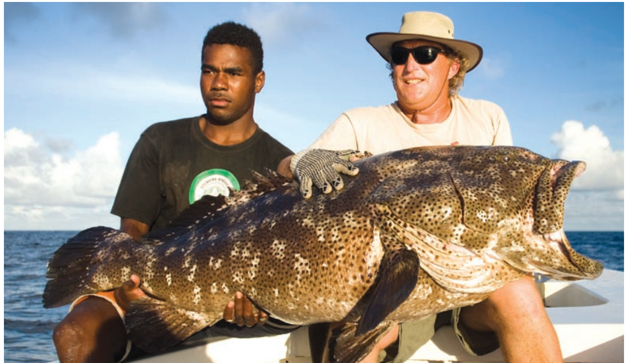
The Katch1 King jig strikes again – this time attracting the attention of a 45kg flowery cod.

About two minutes later my line slackened on the down-drop, suggesting the bottom had been reached,