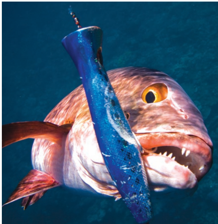
The red bass are very aggressive and make tough opponents, despite their relatively small size.

Not that we were complaining. The time between popper action averaged around ten minutes most days, and you never knew what was